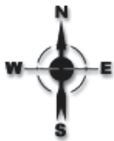
Sketch Floor Plan